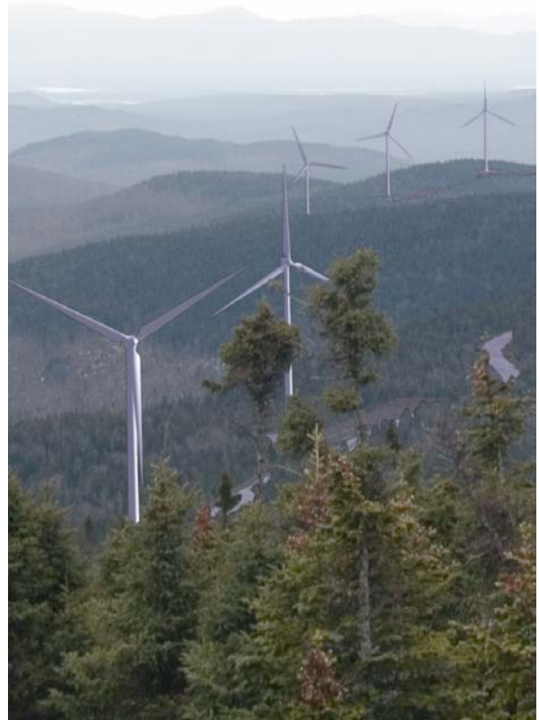
Photomontage of a proposed wind tower development in Maine.

Sophisticated computer software is used to impose images of a proposed structure (e.g., a wind turbine) onto photographs of the development site taken from different locations. This specialized technique renders a very realistic illusion that the photo was taken with the structure actually there.