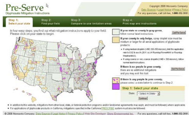
Figure 1: Pre-Serve mitigation instructions, Step 1.

In the initial steps, users are asked about their application methods and rates, as well as the state and county where their fields are located (see Figure 1).