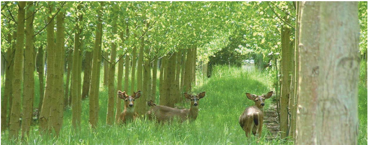
Spray irrigation of a poplar plantation in Woodburn, Oregon