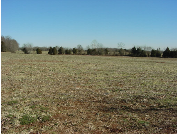
Potential spray irrigation site in Fauquier County, Virginia