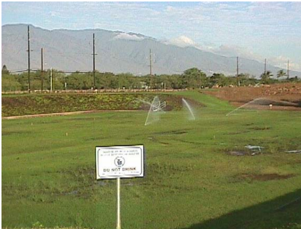
Spray irrigation of reclaimed water on athletic field in Hawaii