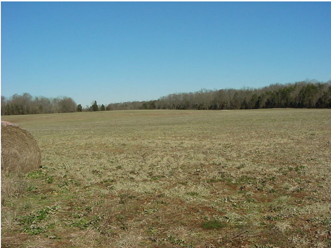
Figure 2: Photo looking northwest towards a portion of the 100-acre parcel, including woods in background.

The proposed project being presented to Fauquier County Parks and Recreation Department and the County Board of Supervisors is to give approximately 100 acres of a 271-acre parcel to the County for their use as a park, with the stipulation that the developer be allowed use of the site for the dispersal of treated residential wastewater using spray irrigation on the recreational ball fields. The developer would design and construct the collection, treatment, storage, and dispersal systems, and would hand over ownership to the Fauquier County Water and Sanitation Authority (WSA) for ongoing operation, maintenance, monitoring, and administration related to the system.