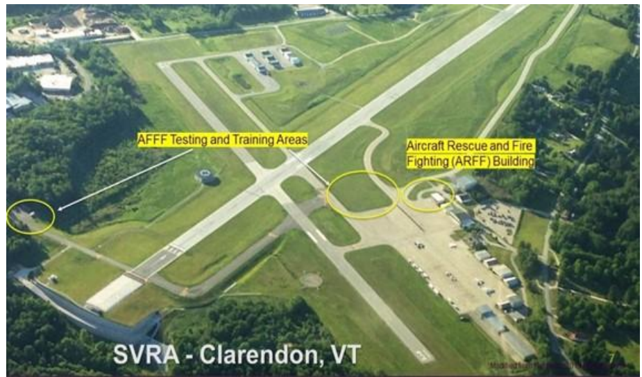
Southern Vermont Regional Airport aqueous film-forming foam (AFFF) testing and training areas.

Platform Environmental Drilling and Remediation Services Culligan Water Holt Gilmour Survey Associates, LLC Pace Analytical Services, LLC Eurofins Environment Testing