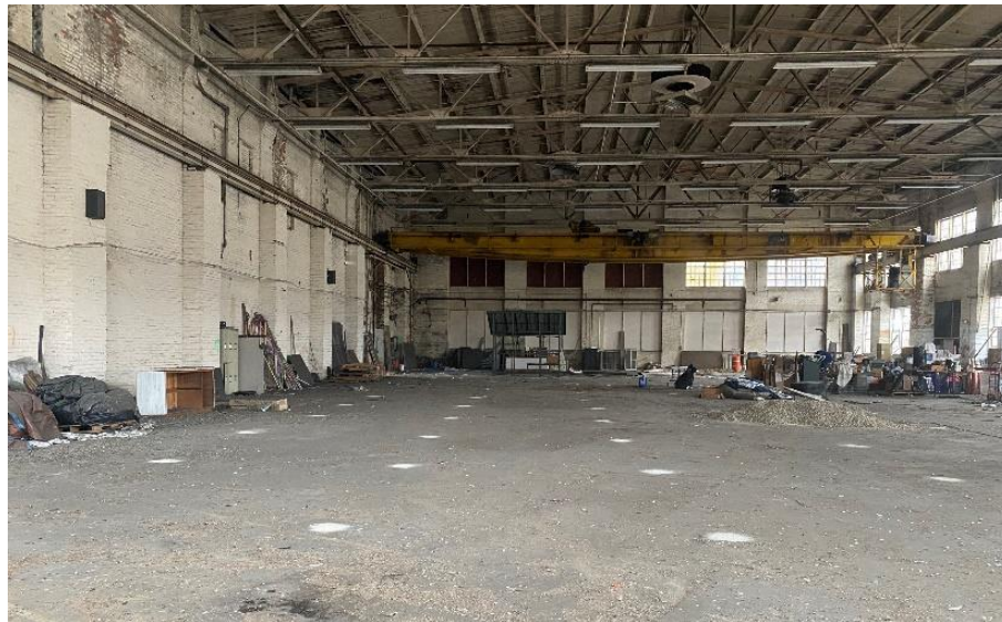
Interior of former Plant #4 foundry building.

Phoenix Environmental Laboratories, Inc. Pace Analytical Laboratories NRC Services/US Ecology Gurney Brothers Excavation