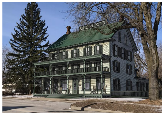
6 South River Street (Former Riviere Hotel)