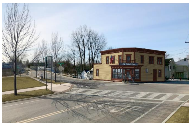
3 Depot Street (Moreau Building)