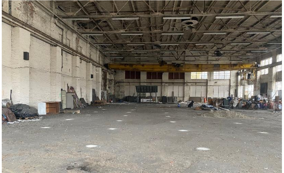
Interior of former Plant #4 foundry building.

Phoenix Labs Con-Test NRC Services/US Ecology Gurney Brothers Excavation